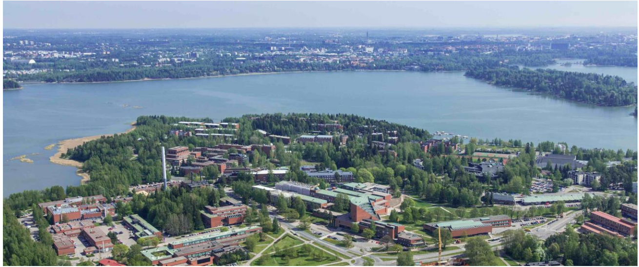
First picture: view of Helsinki and its cathedral / Second picture: aerial view of Espoo, located west of Helsinki