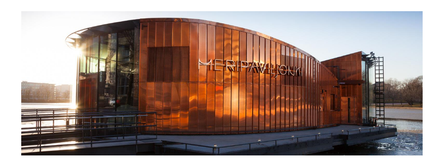
27<sup>th</sup>- 28<sup>th</sup> September: General Assembly meeting (all partners) – Executive Board meeting

Departure at 19:15 in front of the Radisson Blu hotel in Espoo (30-minute trip: 10-min. walk to the metro station Aalto University , 15-min. trip with M1 until Hakaniemen metroasema , 3-min. walk).